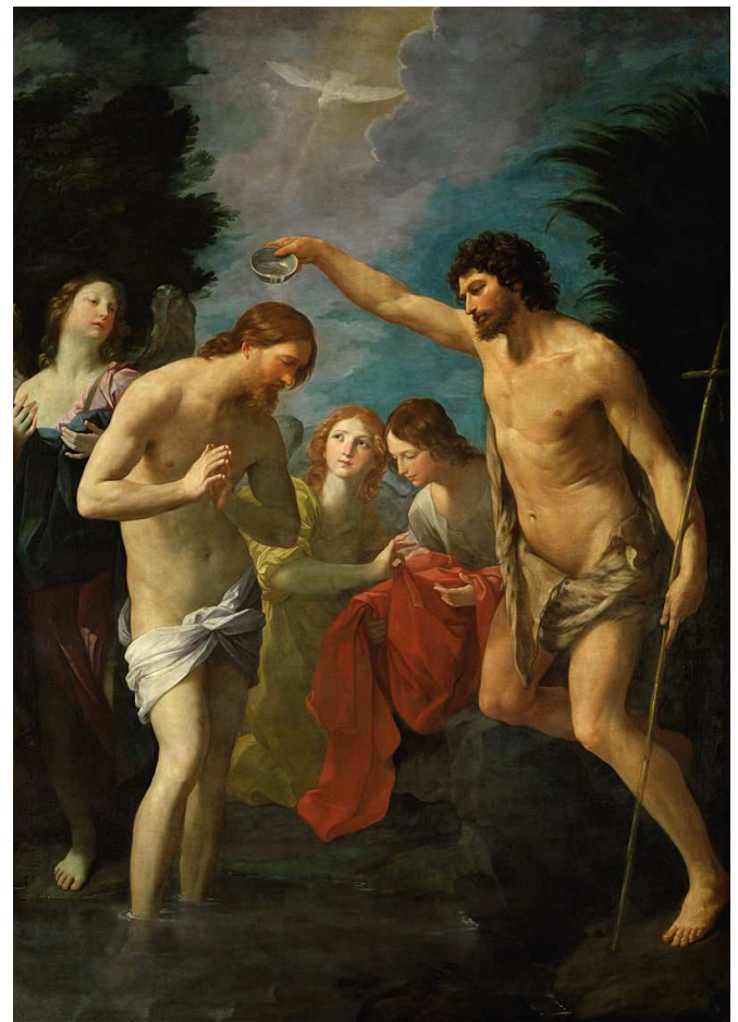
The Baptism of Christ , Guido Reni 1575-1642

Knowledge about art is highly rewarding and a lifelong experience. As well, it helps us enjoy and appreciate the God-given talents and gifts of others. The study will enhance one's inner, personal experience of faith, and foster a greater understanding of Christ's teachings.