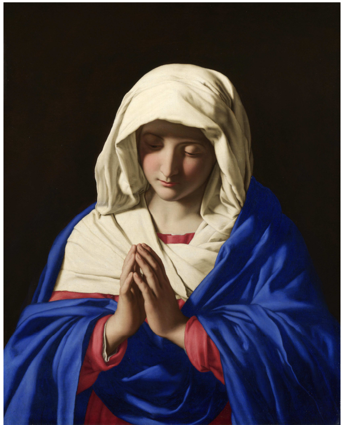
The Virgin in Prayer - Giovanni Battista Salvi National Gallery, London

隨著 1969 年修訂羅馬教曆，節日從主顯節後的第一個星期日轉移到聖誕節八日的星期日。