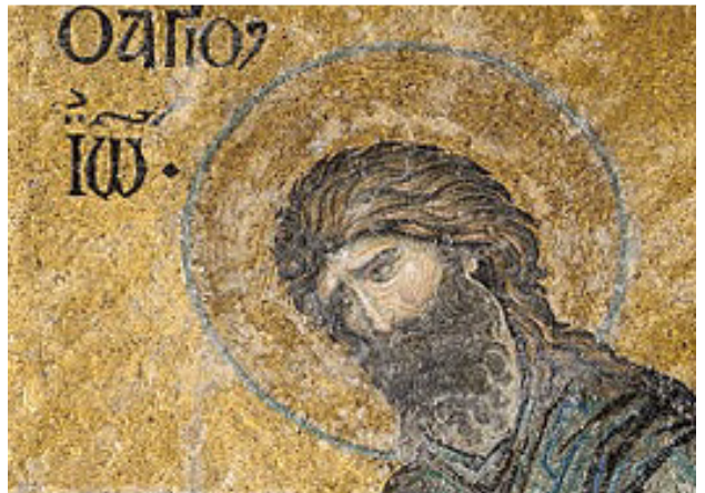
施洗若翰 - 鑲嵌畫的一部分, Hagia Sophia Church

他的名字是天使給予的，不像猶太人的習俗，按父親的名字傳承下去。可是他不相信天使的話---他將得到一個兒子，他因此而暫時變成啞吧。及至孩子生下來，他獨排眾議，按照天使的指示，將孩子取名為若翰，這時他的口就開了。在這九個多月當中，他都不能說話，而他一開口說話就讚美上帝，又充滿了聖神，說出預言來。在他的預言裡提到這個孩子的使命，也提到上主為他預備道路，使他的百姓認識救恩。