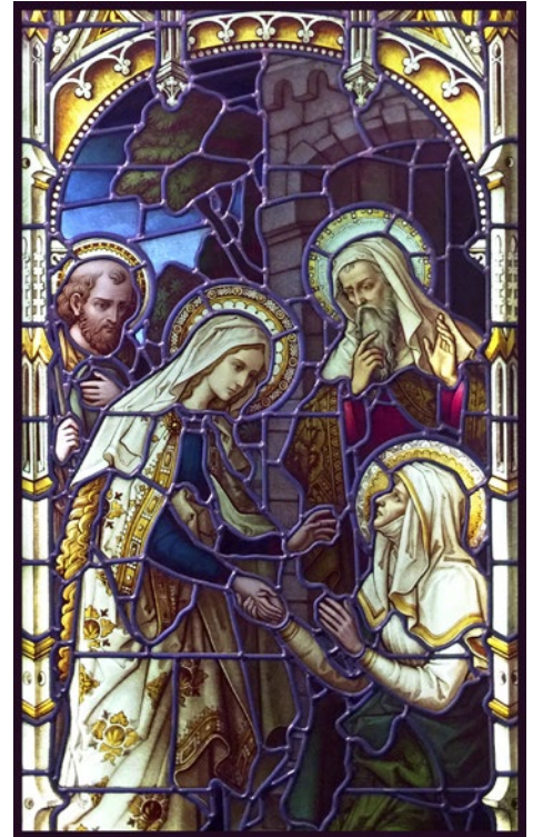
Stained glass, artist's imaginative depiction of Mary telling her parents, Ann and Joaquim, that she is with child.