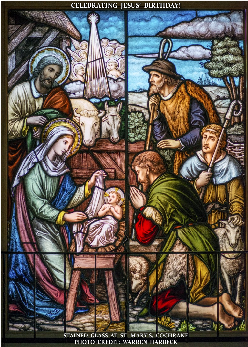
STAINED GLASS AT ST. MARY'S, COCHRANE