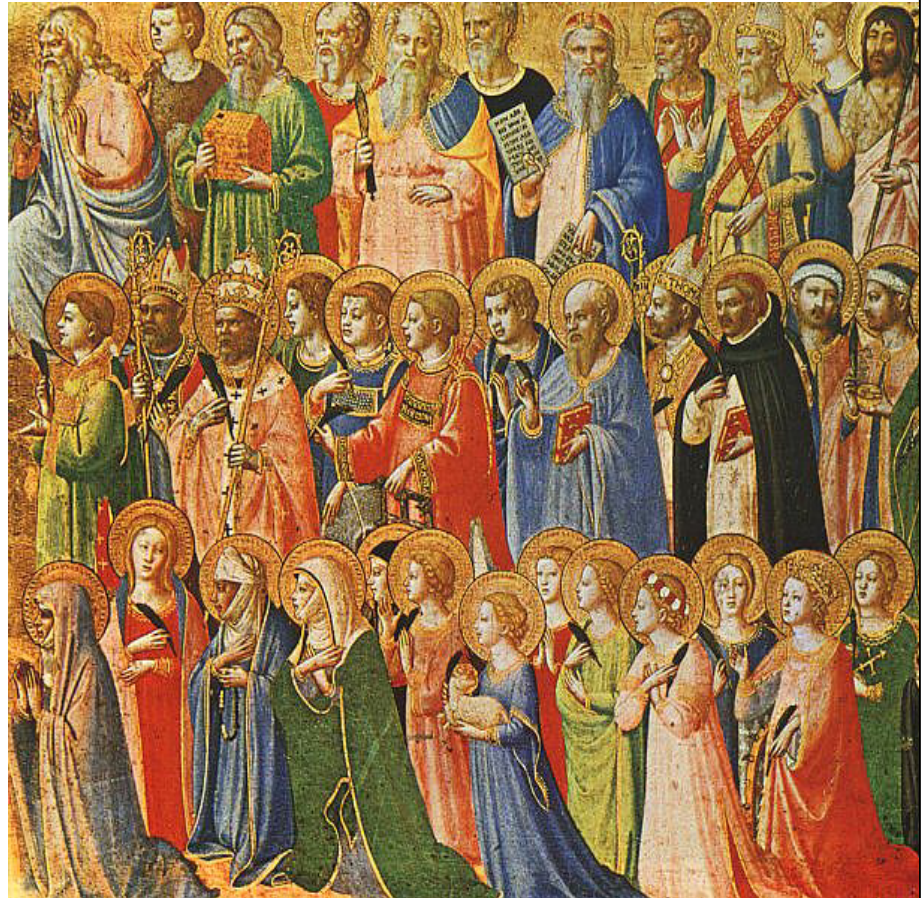
Fra Angelico's Forerunners of Christ with Saints and Martyrs (c 1423-24)

"All Saints' Day and All Souls' Day are related, but they are two separate celebrations. On All Saints' Day there's a call to live as saints, to remind us how we're supposed to live. On All Souls' Day, we're talking about all souls and asking God's mercy for them. We're talking about those people who have died before us, and their process of getting to heaven, through Christ."