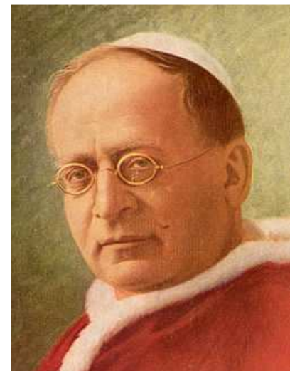
Pope Pius XI 碧岳 11 世