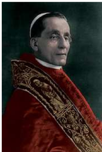
Pope Benedict XV 本篤 15 世

Message Of His Holiness Francis For World Mission Day 2018